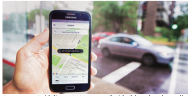
Aggregator Guidelines 2020.

The court was hearing a special leave petition filed by Uber challenging the Bombay High Court order directing it to apply for an aggregator licence in Maharashtra in compliance with the Centre's Motor Vehicle