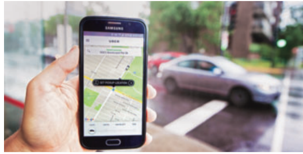
Aggregator Guidelines 2020.

The court was hearing a special leave petition filed by Uber challenging the Bombay High Court order directing it to apply for an aggregator licence in Maharashtra in compliance with the Centre's Motor Vehicle